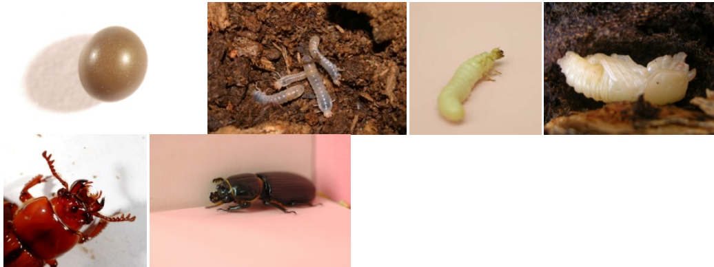
Figure 3. Human and betsy beetle life stages. The picture of small larvae was taken by Dr. Kristen Baum.