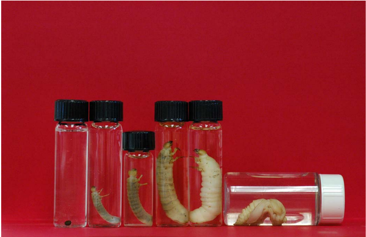
Figure 1. Egg, 1 st instar, 2 nd instar, 3 rd instar, prepupa, and pupa of the betsy beetle (Coleoptera: Passalidae: Odontotaenius disjunctus )