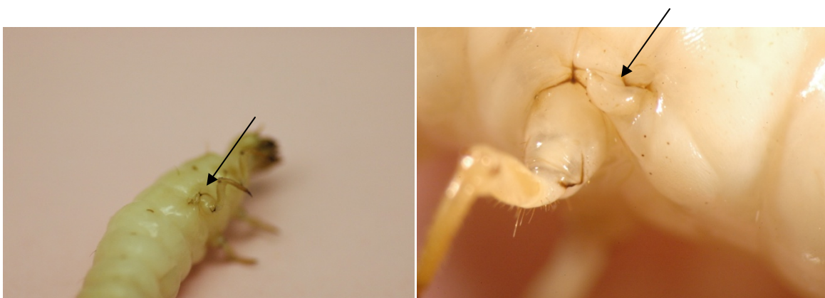
Figure 2. The modified third leg of a larva. By scraping this leg against their body, larvae "talk" to their parents.

Pass out classroom set of beetles, larvae, and adults. Have students describe the differences between larvae and adults.